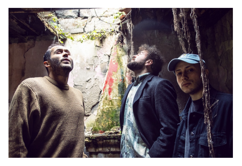
TERESA PARODI PREMIO WORLD MUSIC INTERNATIONAL 2024