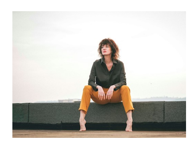
OSSO SACRO - Vincitori edizione 2023